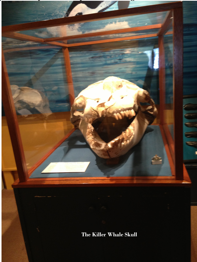
The Killer Whale Skull

Some of the highlights of those early years were the procurement of a killer whale skull in January 1944 from a whale that was beached in Orient Point, Long Island. Dr. Davenport, the curator, instead of using a slower, but easier method of maceration in a pond, he boiled the skull in a cauldron in an open shed in the bitter winter. He caught a cold, developed pneumonia and passed away in February 1944 at the age of 78.